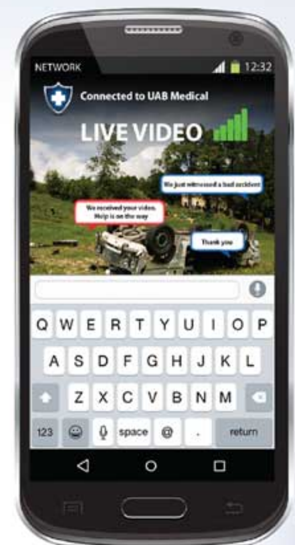
Chat with Dispatcher

With PanicAPP, you can take comfort in knowing help is only a click away!